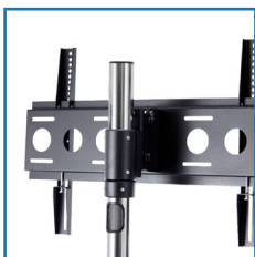
Seamless height adjustment