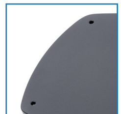
Floor mounting option