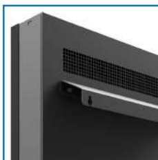
Durable steel construction