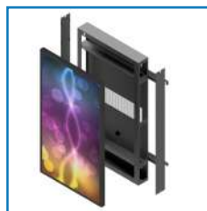
Quick and easy assembly